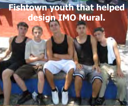
Fishtown youth that helped design IMO Mural.