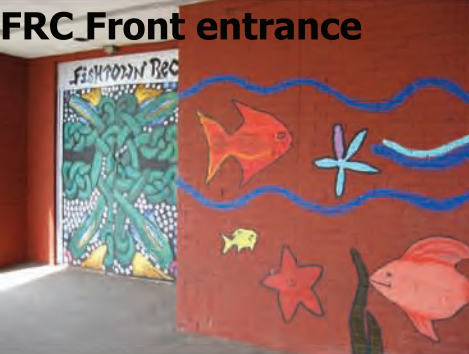
FRC Front entrance