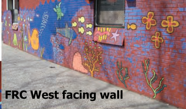
FRC West facing wall

While we facilitate art projects, we help participants visualize and create new futures by redefining interpretations of themselves and others.