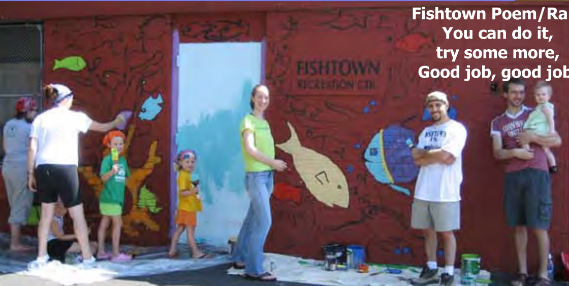
Fishtown Poem/Rap: You can do it, try some more, Good job, good job.