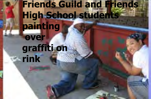
Friends Guild and Friends High School students painting over graffiti on rink