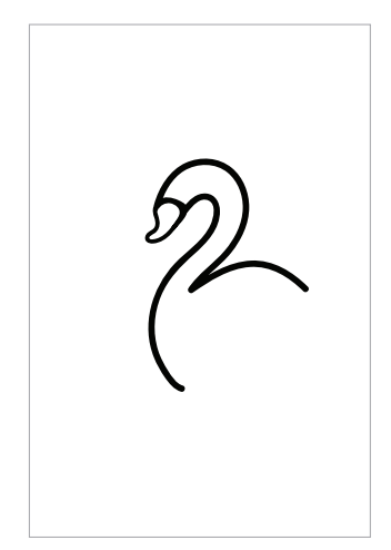
3. Connect the head to the body.