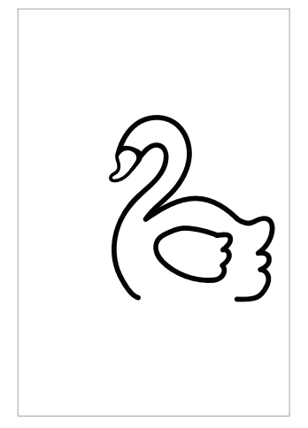
6. Complete the wing.