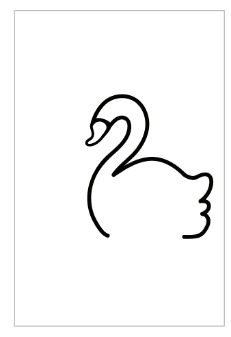
4. Draw the tail.