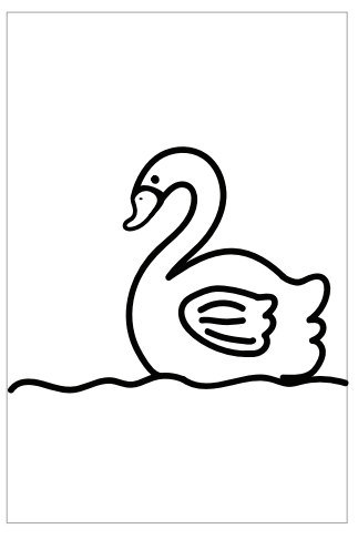
8. Draw the water waves.