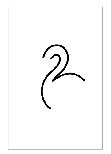
2. Write another number 2.