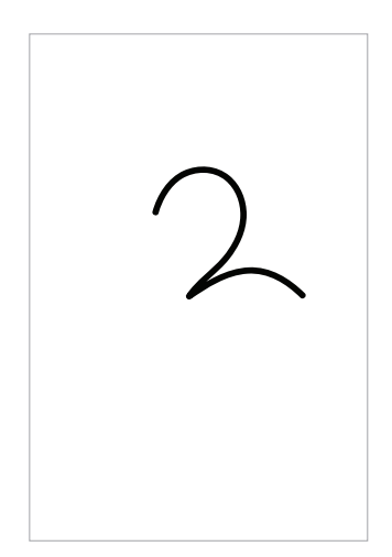
1. Write the number 2.