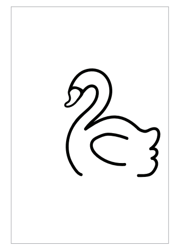
5. Draw the wing.