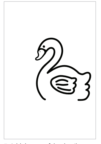
7. Add the rest of the details.