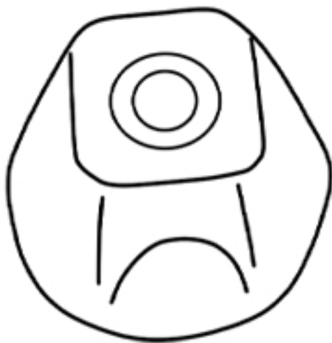
Egg carton cup