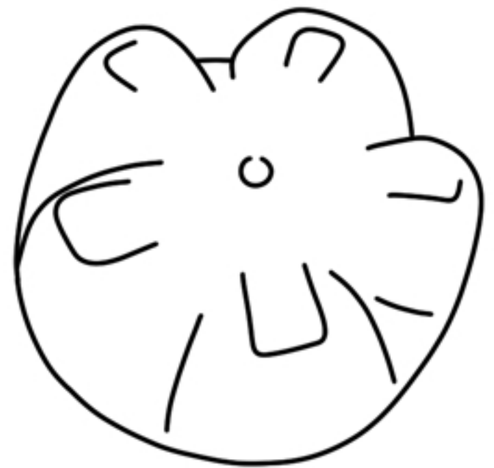
Bottom of a plastic bottle