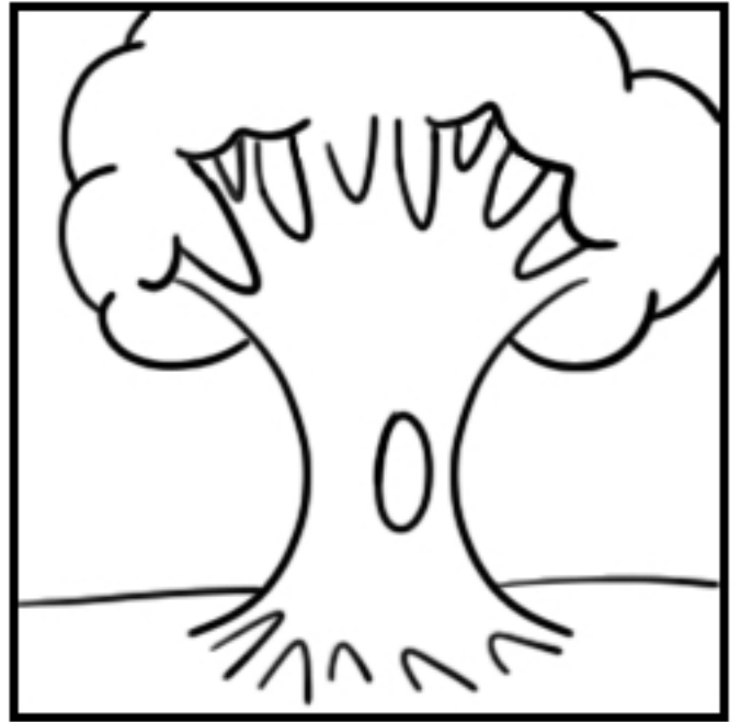
Step 4: Add leaves, grass, flowers and whatever else you want!