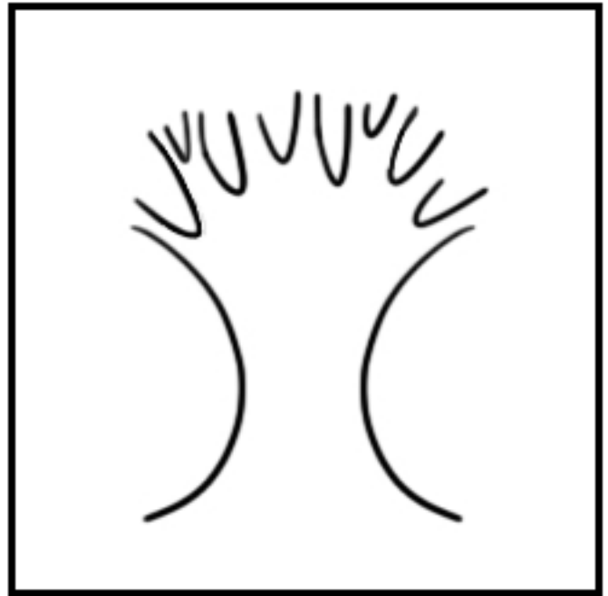
Step 2: Add U's to create branches